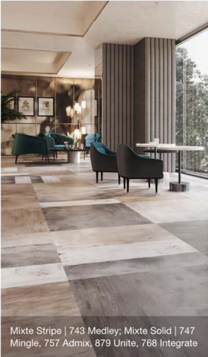
Mixte Stripe | 743 Medley; Mixte Solid | 747 Mingle, 757 Admix, 879 Unite, 768 Integrate

Inspired by old-world Italian stone, Mixte offers an updated stone visual with a modern industrial twist. The collection's two styles include carefully shaded solid colors with a softened, time-worn feeling, and a coordinating tile that mixes random stripes.