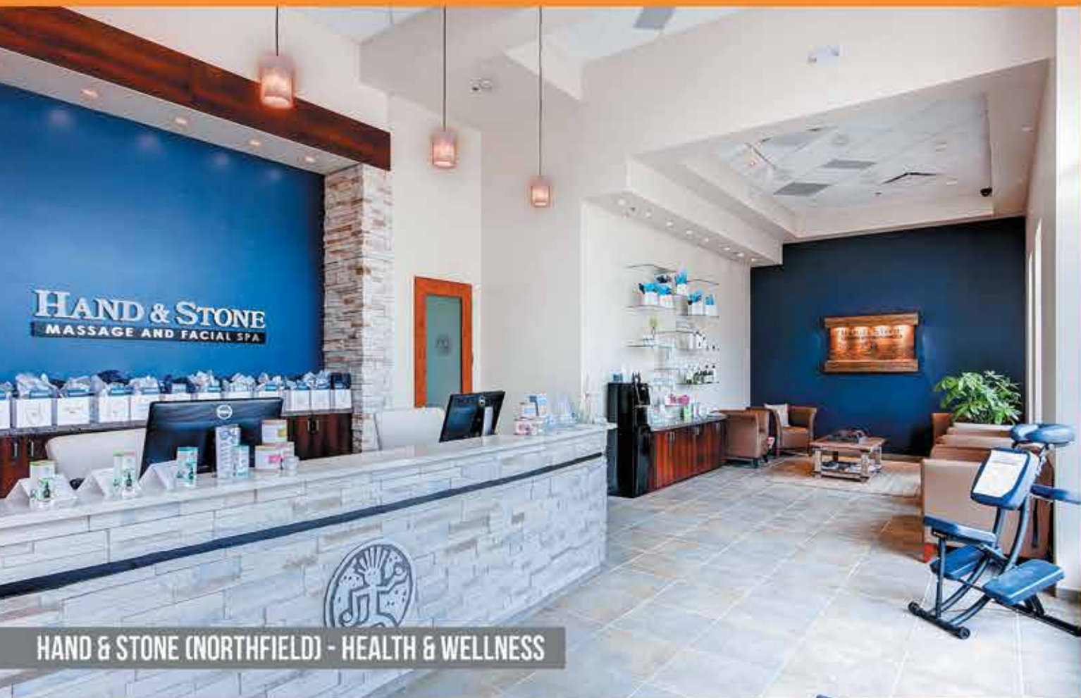
HAND & STONE (NORTHFIELD) - HEALTH & WELLNESS