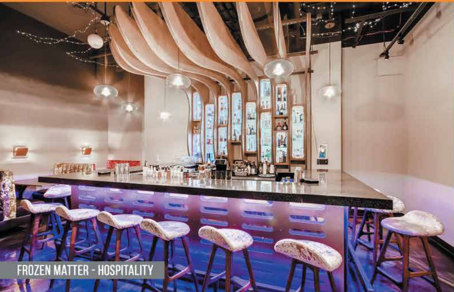
FROZEN MATTER - HOSPITALITY