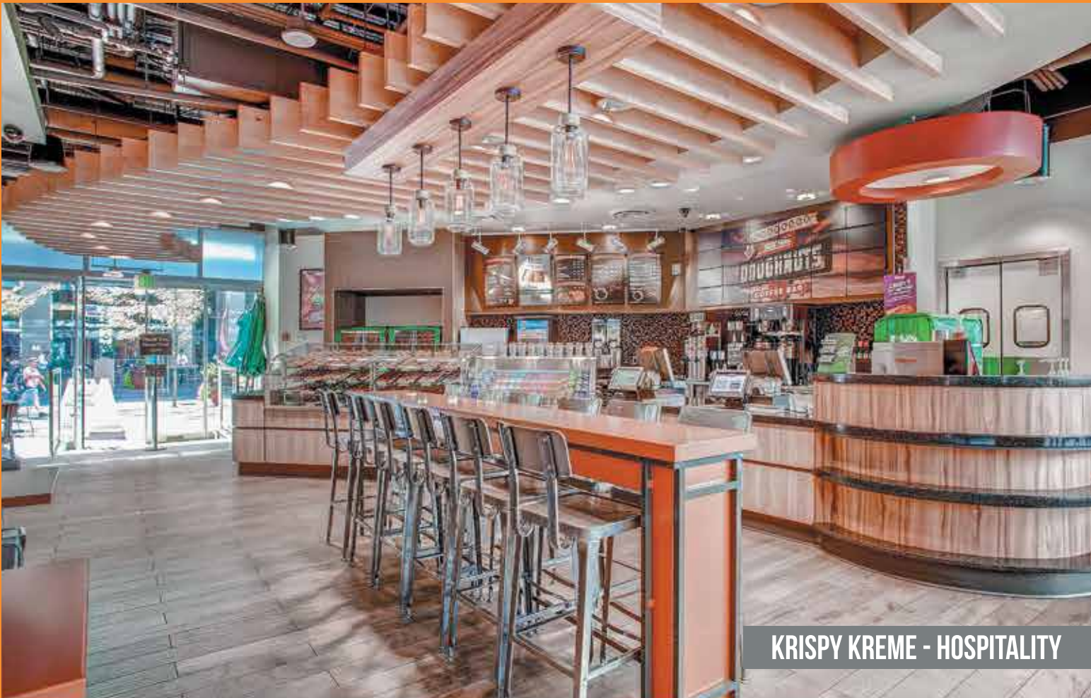
KRISPY KREME - HOSPITALITY