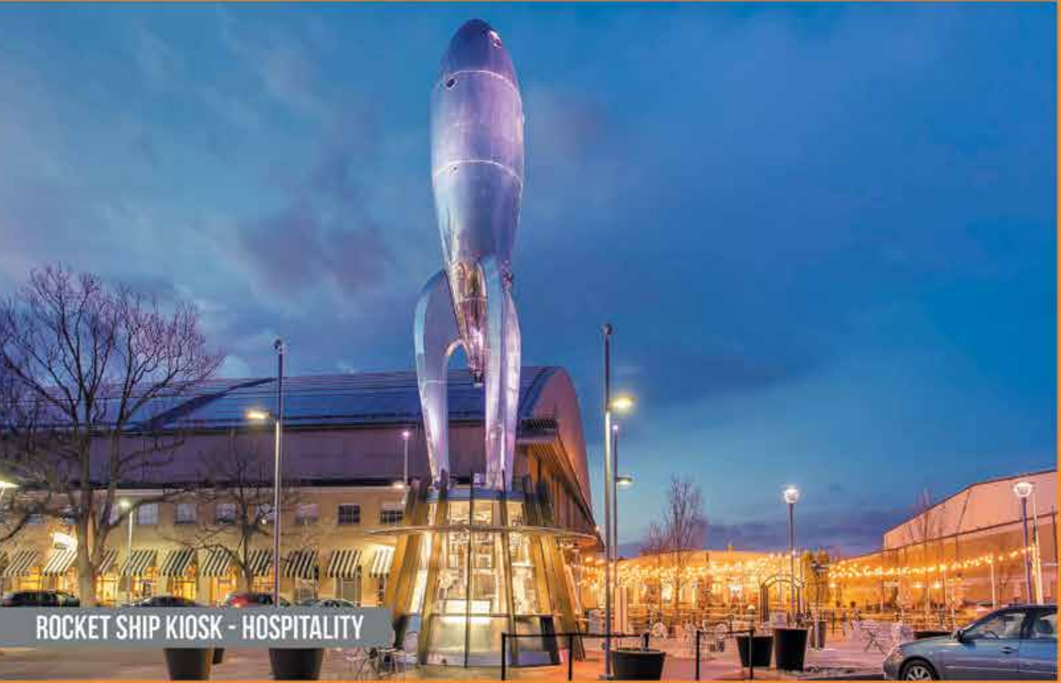
ROCKET SHIP KIOSK - HOSPITALITY