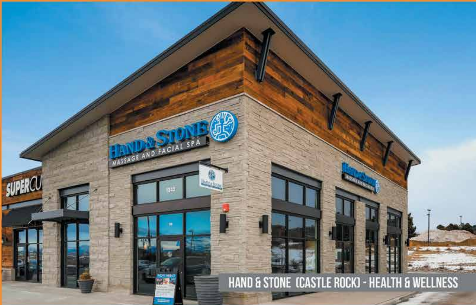
HAND & STONE (CASTLE ROCK) - HEALTH & WELLNESS