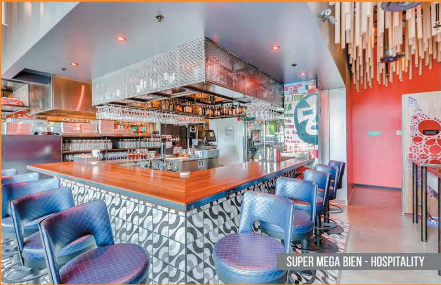
SUPER MEGA BIEN - HOSPITALITY