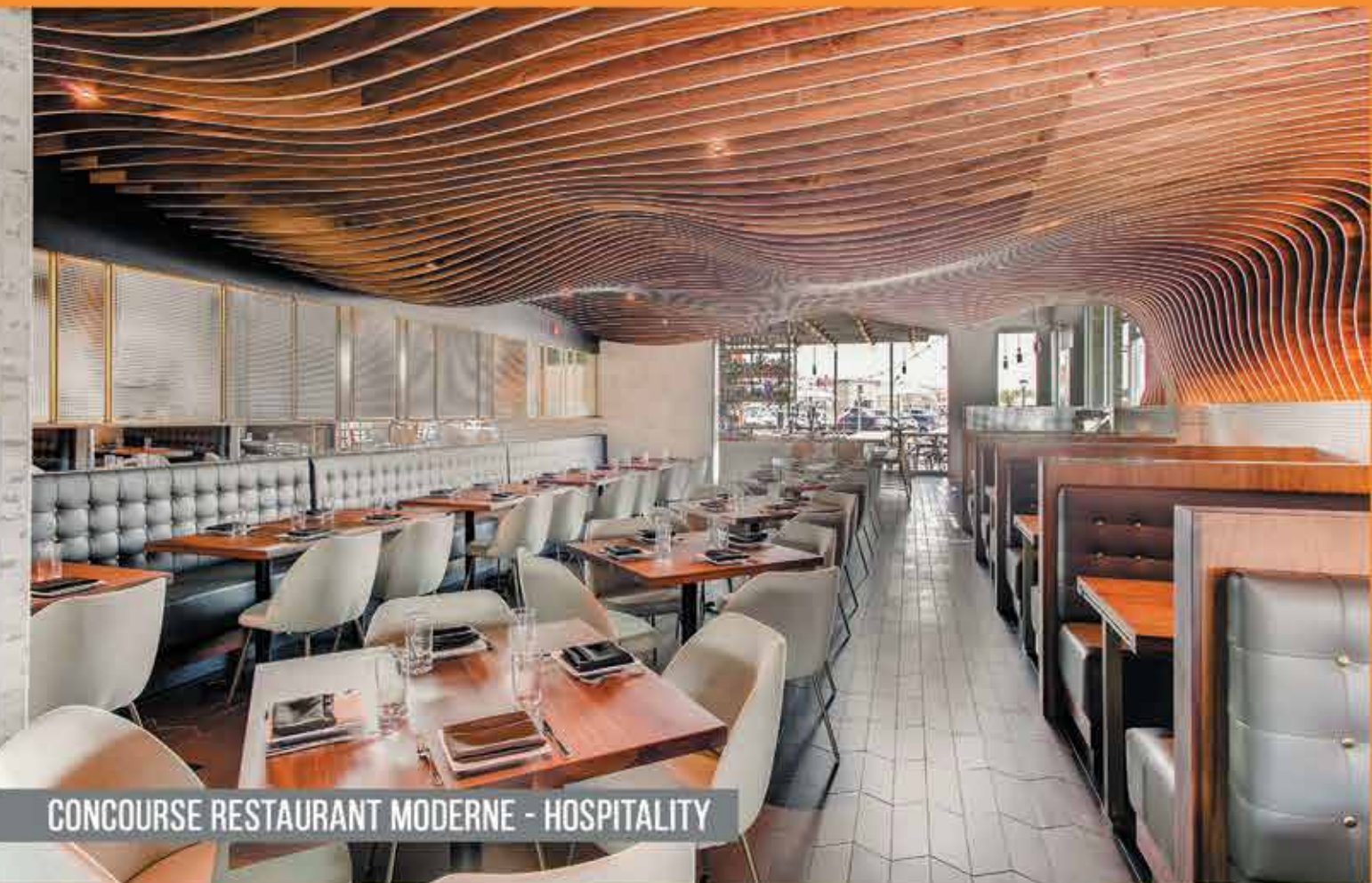
CONCOURSE RESTAURANT MODERNE - HOSPITALITY