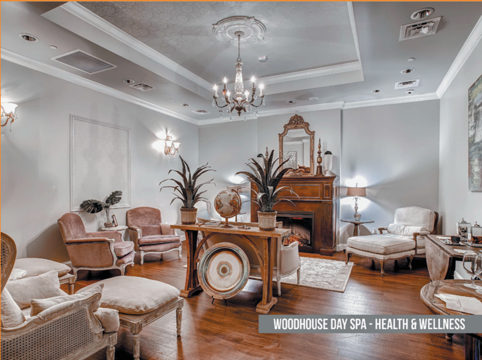
WOODHOUSE DAY SPA - HEALTH & WELLNESS

At HIVE Construction we are committed to your project being a success. We can help manage every aspect of your project down to the smallest details.