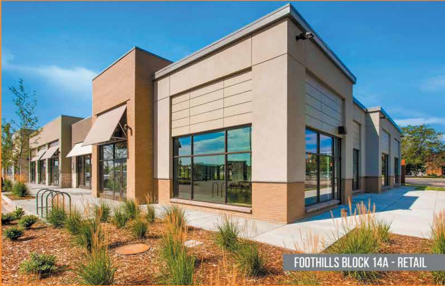
FOOTHILLS BLOCK 14A - RETAIL